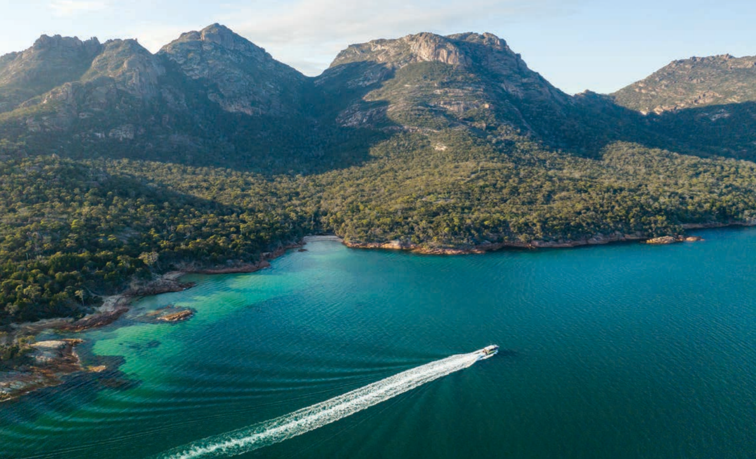
The Hazards mountain range provides a stunning backdrop for our aqua taxi service.