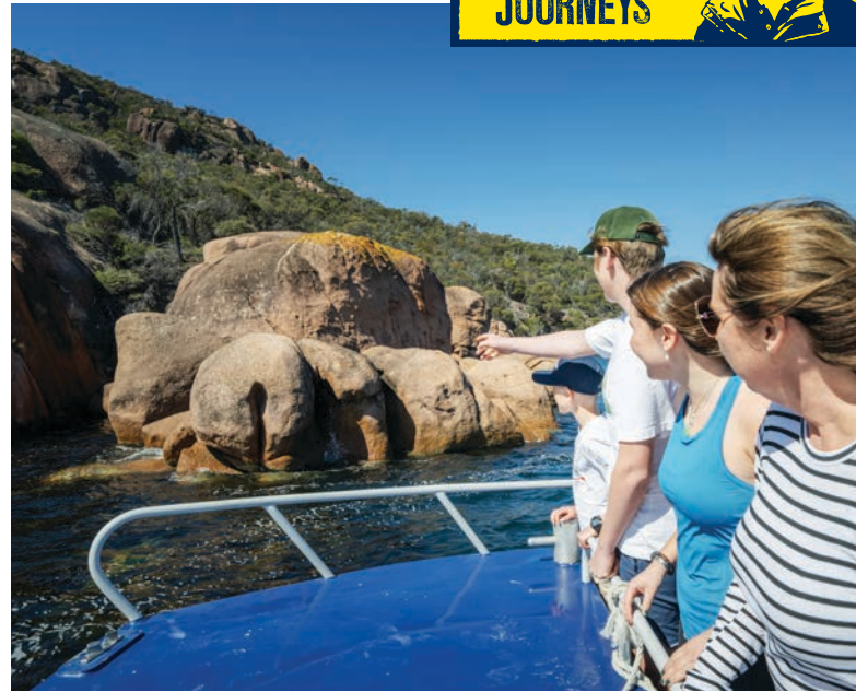
Freycinet Aqua Express gets you up close to the Freycinet Peninsula's rugged granite coast.