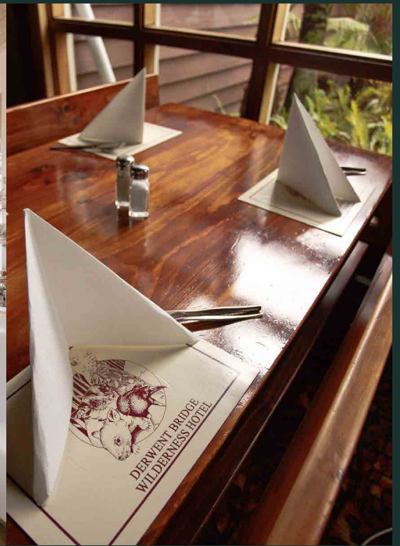
Derwent Bridge Wilderness Hotel