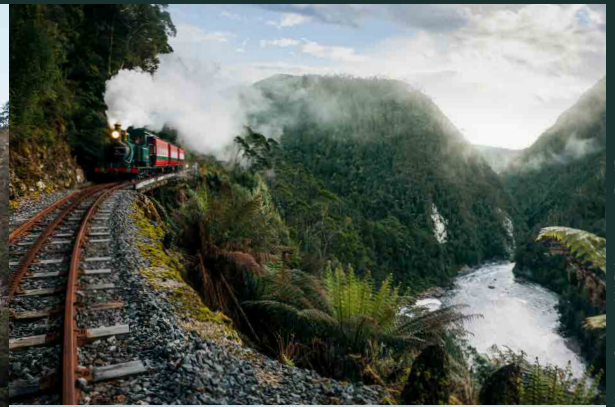
West Coast Wilderness Railway (formerly ABT Railway)