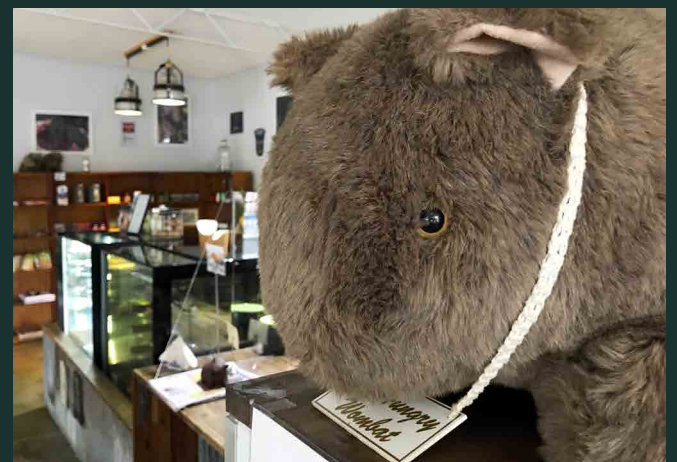
Hungry Wombat Café, Derwent Bridge

Dine indoors or on an undercover deck overlooking Macquarie Harbour.