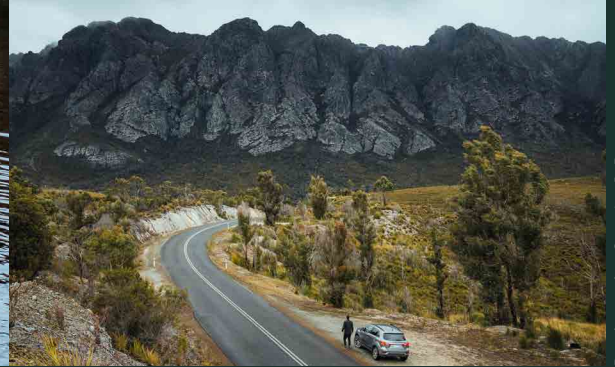
Road to the Sentinel Range