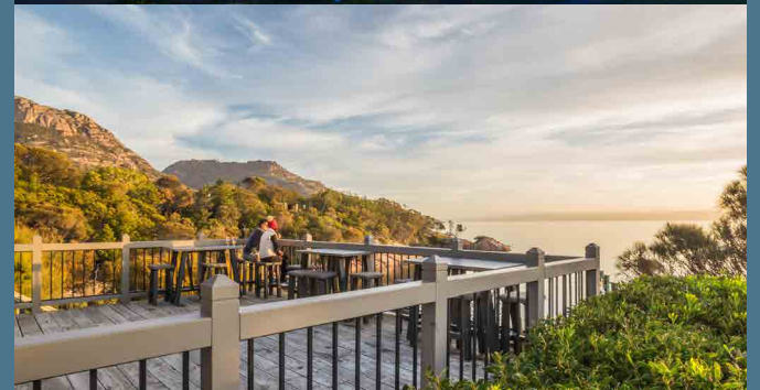
The Fish Van, Triabunna