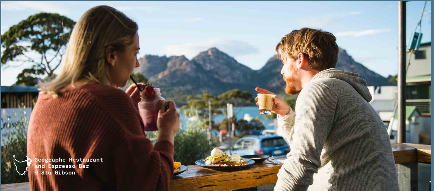
Geographe Restaurant and Espresso Bar