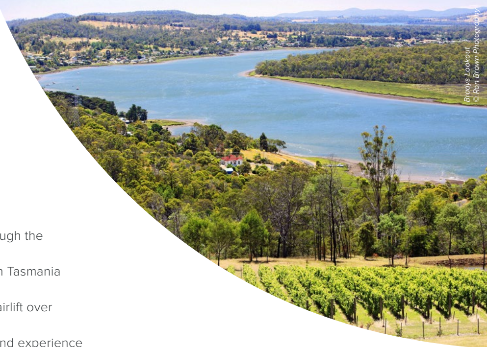
Bradys Lookout