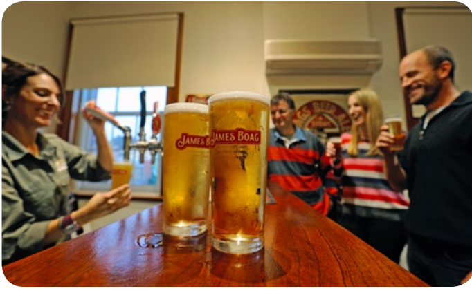
J Boag & Son Brewery