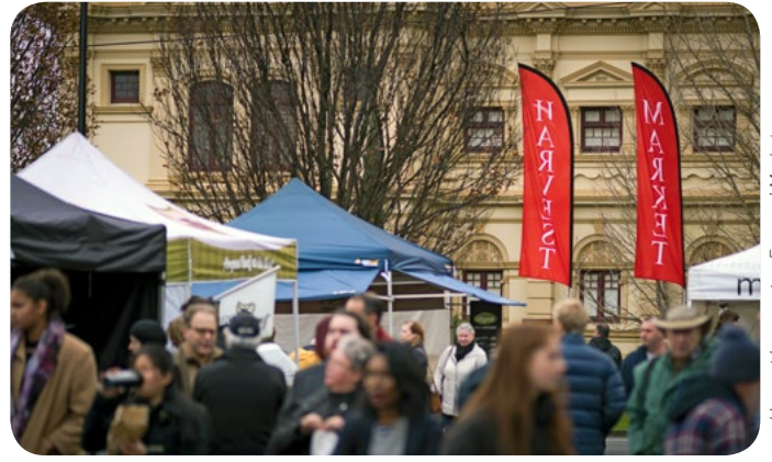
Harvest Launceston Farmers' Market