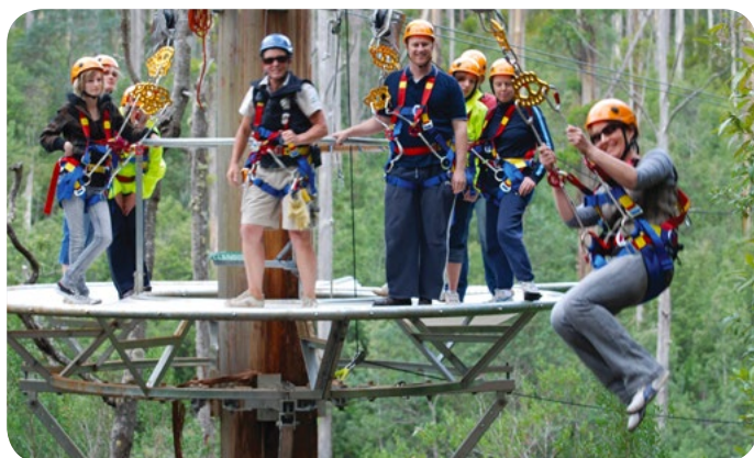
Hollybank Treetops Adventure