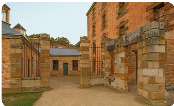
Penitentiary – Port Arthur Historic Site