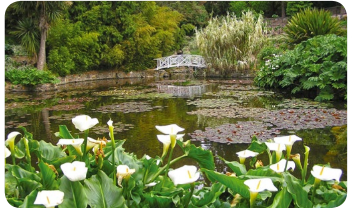
The Lilly Pond – Royal Hobart Botanical Gardens