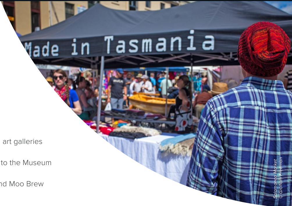
Salamanca Market