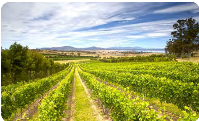
Devil's Corner Cellar Door