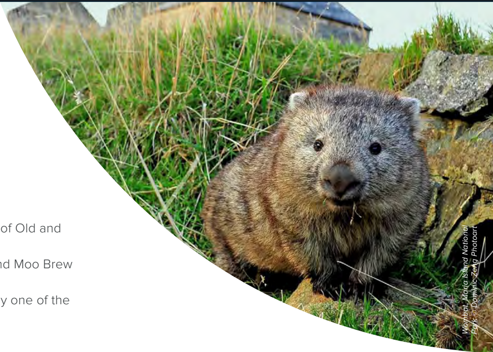
Wombat, Maria Island National Park