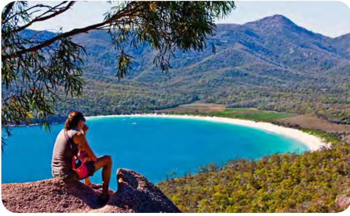
Wineglass Bay from Wineglass Bay Walking Track