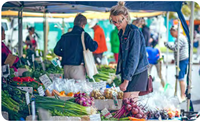
Salamanca Market