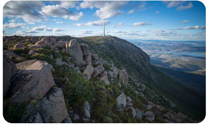
Summit of kunanyi/Mt Wellington