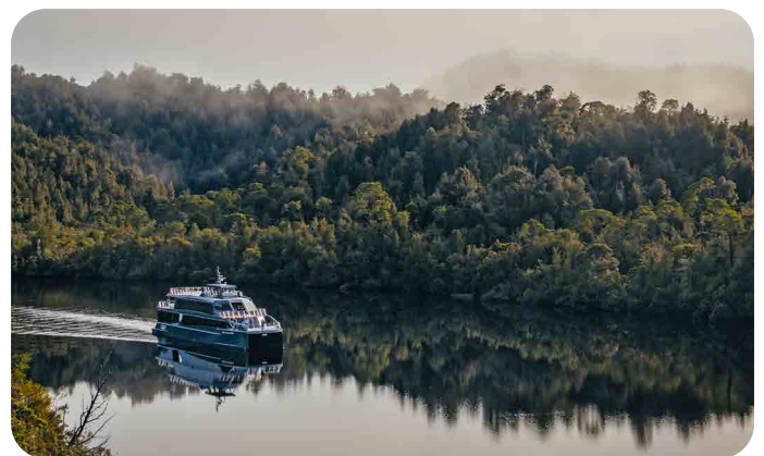
Gordon River Cruises