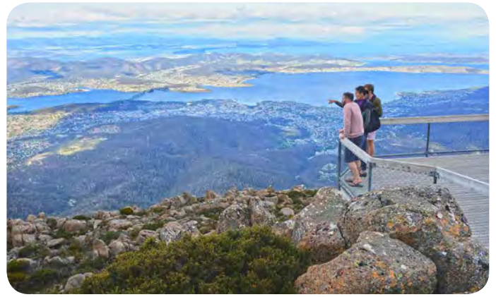
View of Hobart from Mt Wellington/Kunanyi Lookout