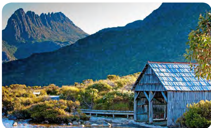
Boat Shed, Lake Dove and Cradle Mountain